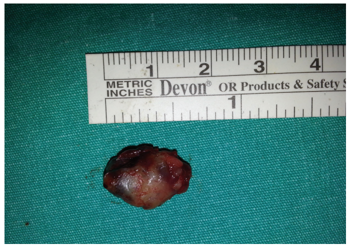
Figure 1: Macroscopic view of the tumor